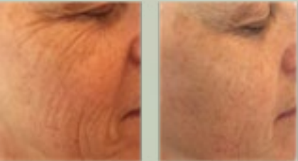
• Before • After